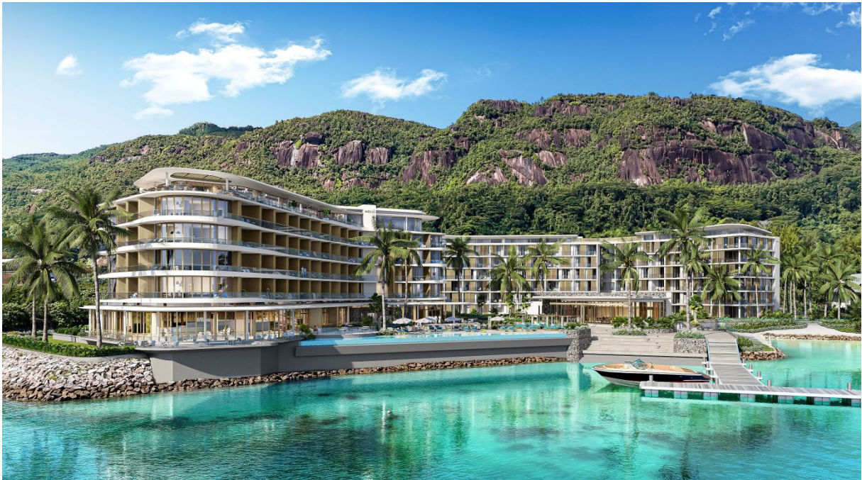
Location of the Seafront Estate resort

(The price includes all transfer taxes, furniture and equipment.)