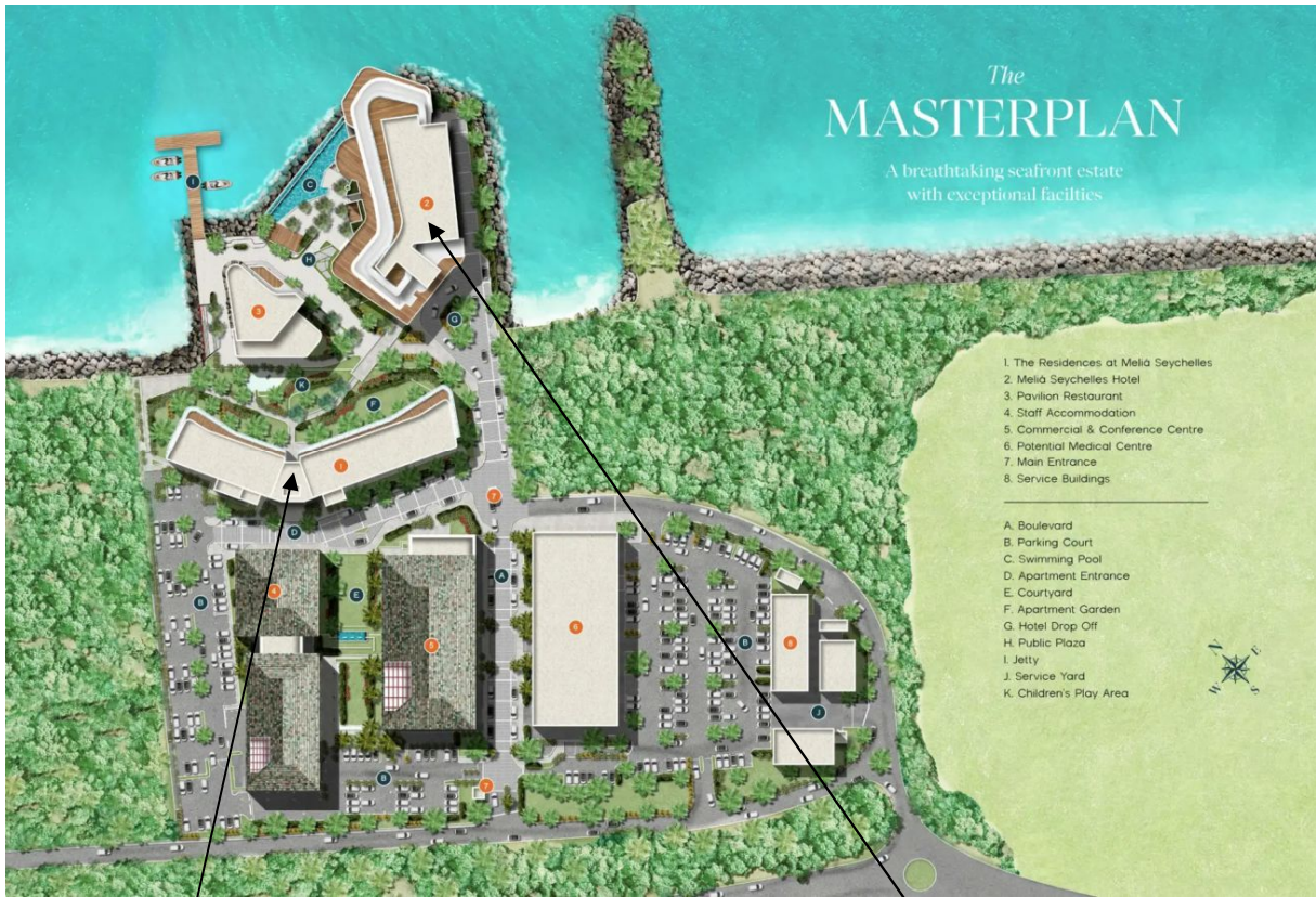
The Residences at Meliá Seychelles