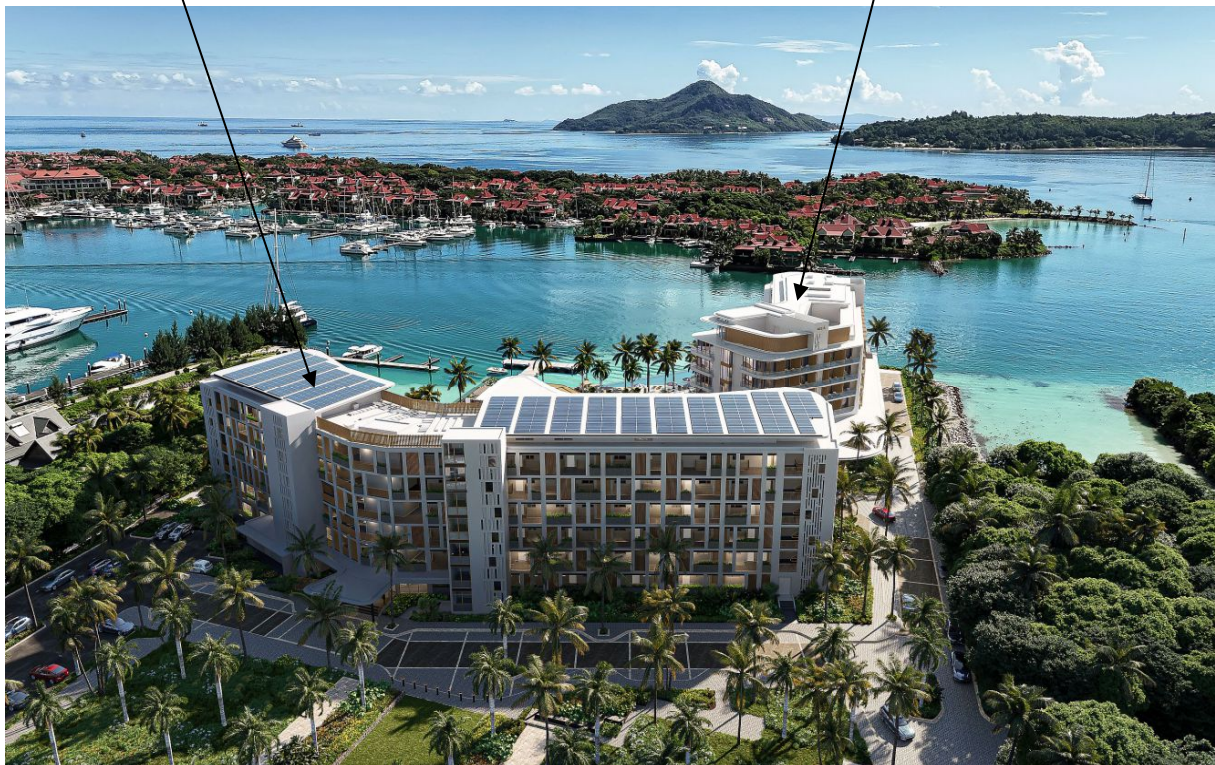
5* Meliá Seychelles Hotel