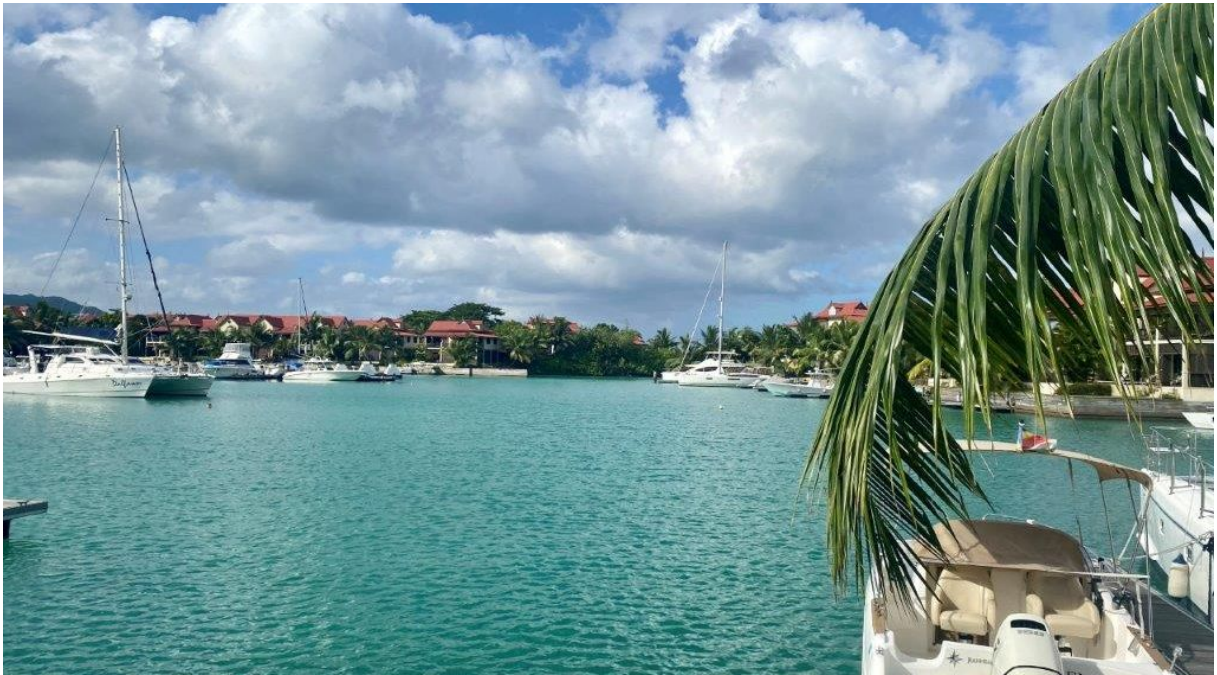
Location of the apartment and boat mooring

Price: USD 435,000 (incl. furniture) + transfer taxes (5% Stamp duty, 1.5% Sanction Application Processing Fee, 1.5 % Notary Fee)