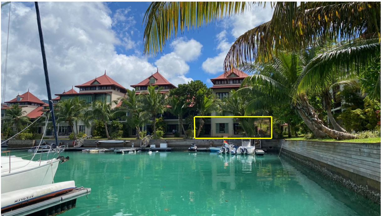
Apartment and boat mooring location

Price: USD 795,000 (incl. furniture) + transfer taxes (5% Stamp duty, 1.5% Sanction Application Processing Fee, 1.5 % Notary Fee)