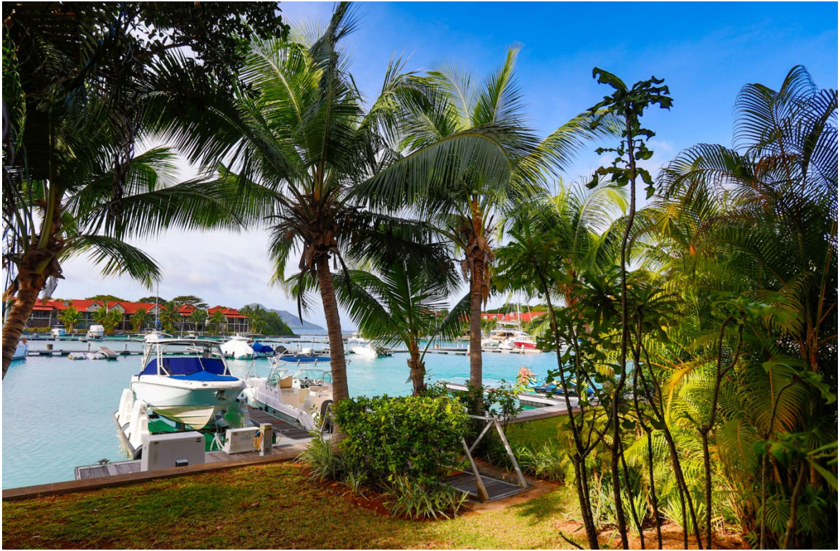
Anse Bigorno beach (approx. 2 minutes walk from the apartment house)