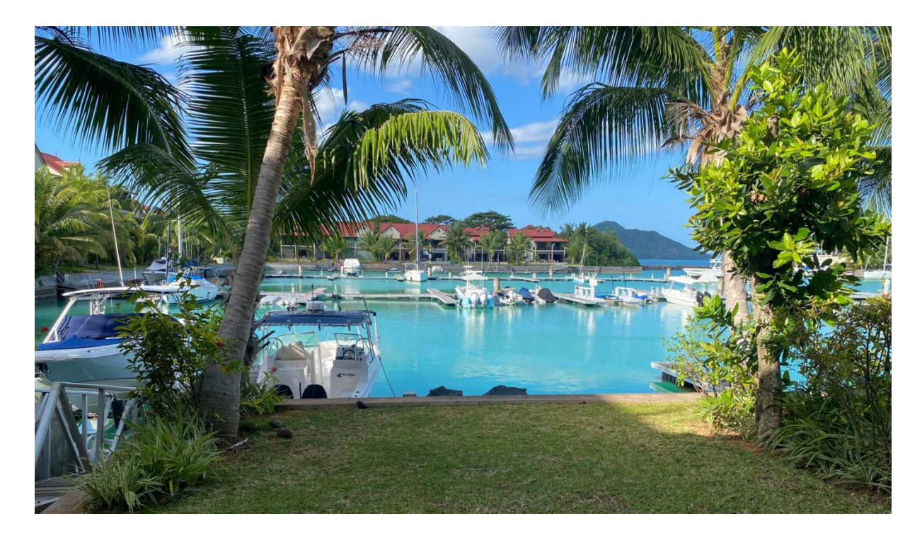
Location of the apartment and boat mooring

Price: USD 625,000 (incl. furniture) + transfer taxes (5% Stamp duty, 1.5% Sanction Application Processing Fee, 1.5 % Notary Fee)