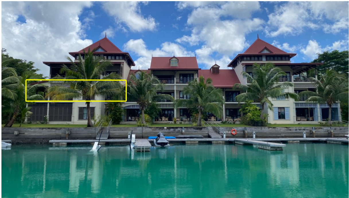
Apartment and boat mooring location

(5% Stamp duty, 1.5% Sanction Application Processing Fee, cca 1.5% Notary Fee)