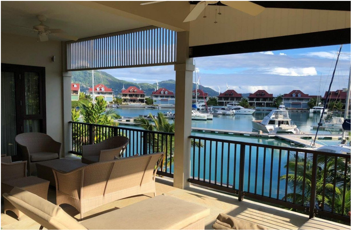
Private boat mooring at the apartment house