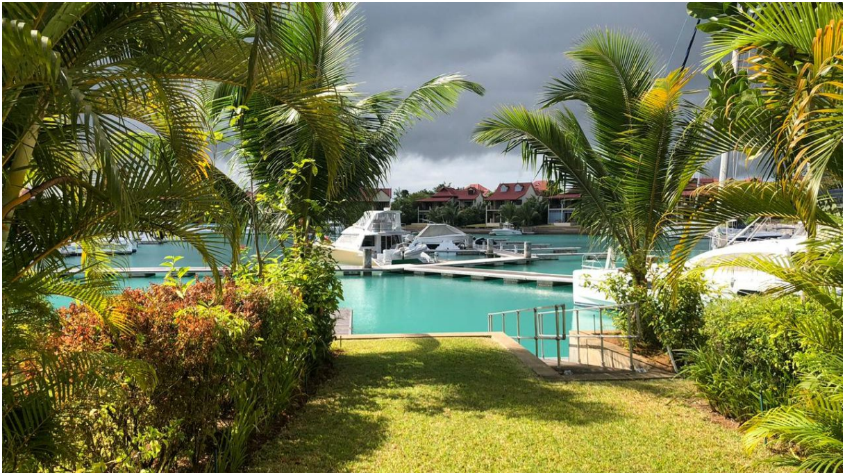
Location of the apartment and boat mooring

Price: USD 445,000 (incl. furniture) + transfer taxes (5% Stamp duty, 1,5% Sanction Application Processing Fee, 1,5 % Notary Fee)