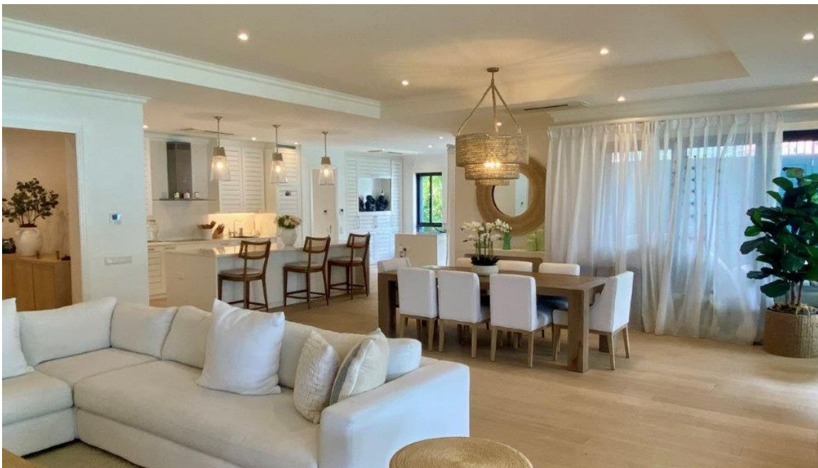
Apartment and boat mooring location

(5% Stamp duty, 1.5% Sanction Application Processing Fee, cca 1.5% Notary Fee)