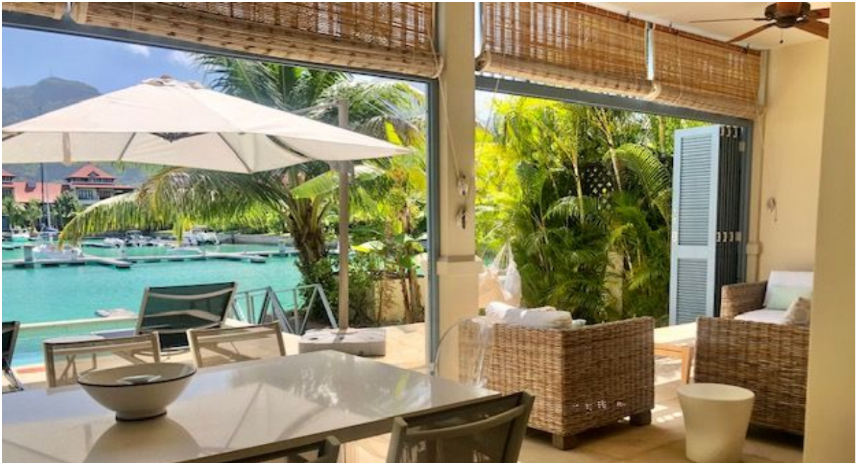
Maison location on Eden Island

(5% Stamp duty, 1,5% Sanction Application Processing Fee, cca 1,5% Notary Fee)