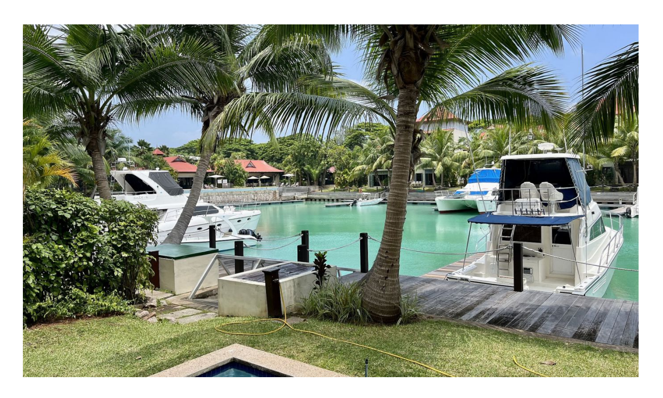
Maison location on Eden Island

(5% Stamp duty, 1.5% Sanction Application Processing Fee, 1.5 % Notary Fee)