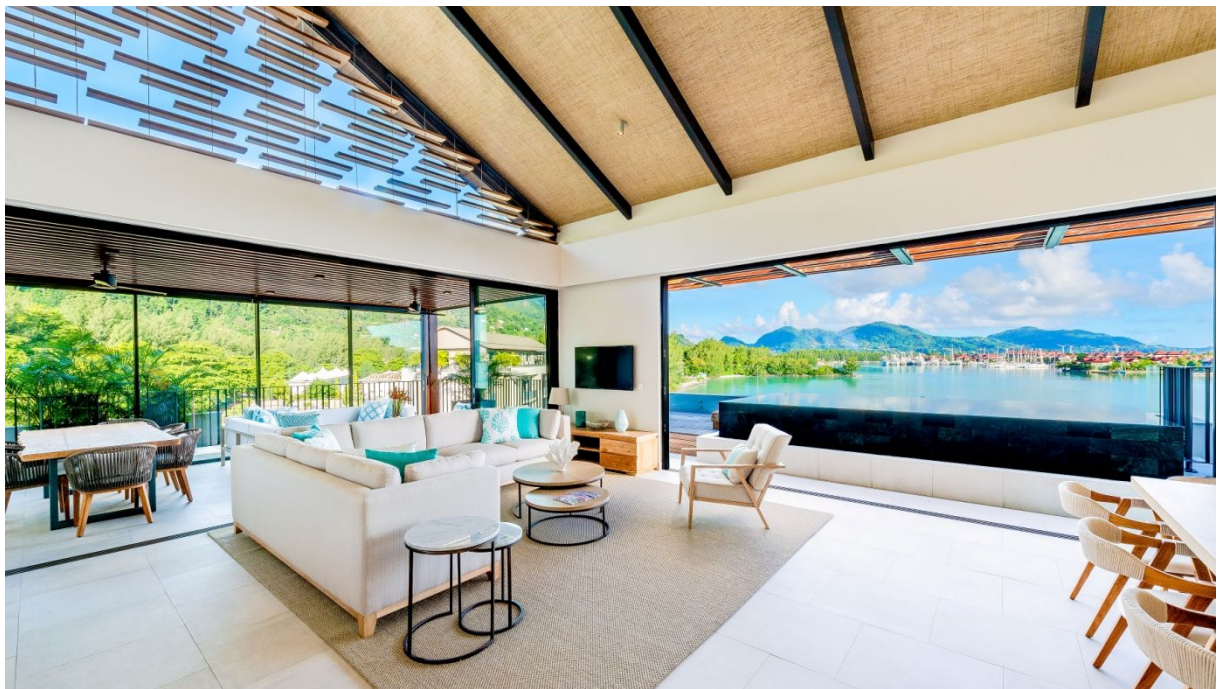
Location in Pangia Beach

(The price includes all furniture, a dedicated carport, lock-up garage and boat mooring.)